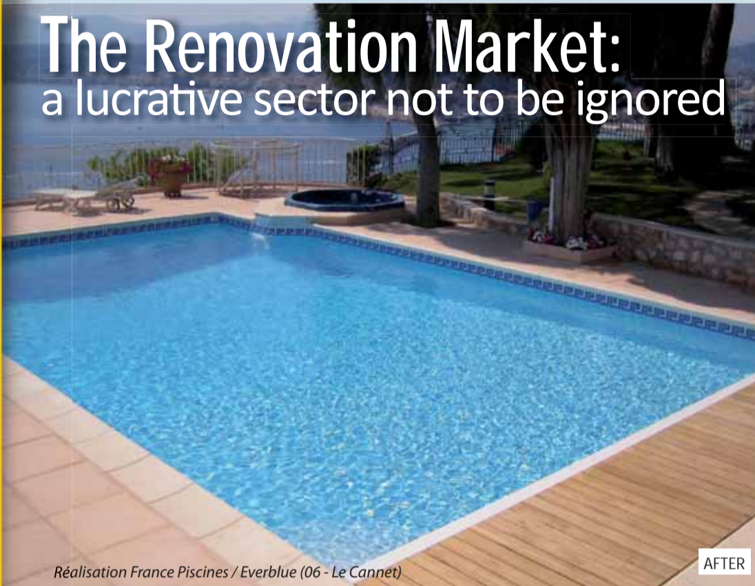
Réalisation France Piscines / Everblue (06 - Le Cannet)