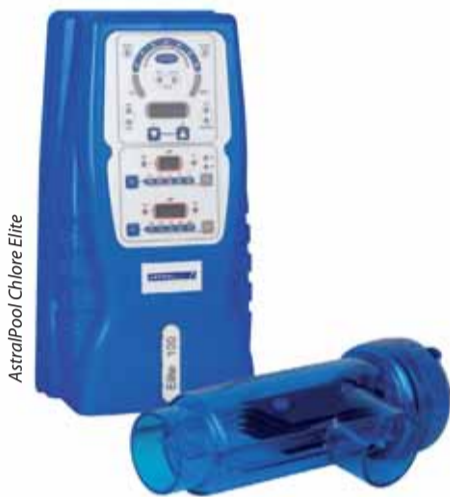
AstralPool Chlore Elite

Salt electrolysis is a simple electrochemical reaction. When water turns slightly salty, usually around 3 to 7g of salt per litre, an electrolytic cell produces a powerful disinfectant: chlorine gas. The cell (or electrode) is composed of titanium plates polarized by DC power. When the salt water flows into the cell it produces disinfected and disinfecting water. Bacteria, chloramines and algae are destroyed, without residue or pollution. Bacteria are sources of infection, chloramines cause allergies and algae make water cloudy or green.