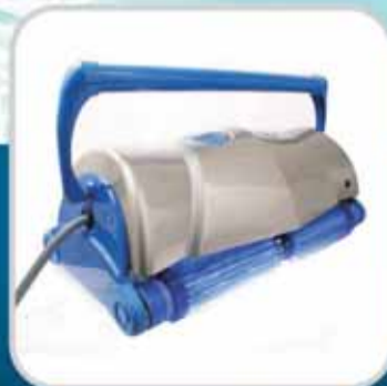
ULTRAMAX Commercial Public Pool Cleaner