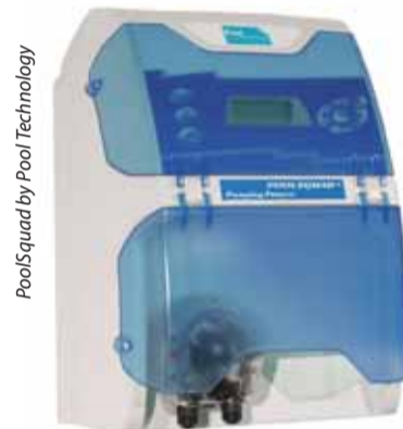
PoolSquad by Pool Technology