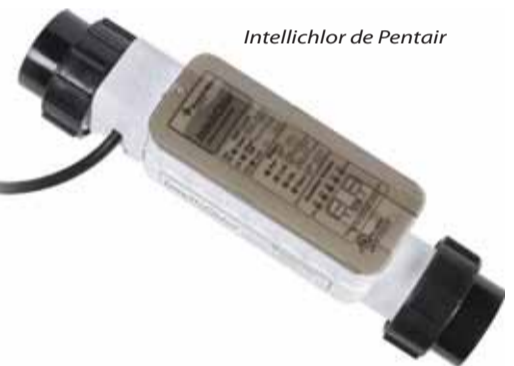
Intellichlor de Pentair

Health and well-being: salt water is therapeutic and does not irritate the eyes or dry the skin.