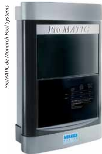
ProMATIC de Monarch Pool Systems