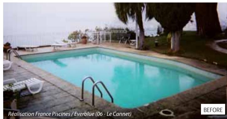
Réalisation France Piscines / Everblue (06 - Le Cannet)

The new owner of the house could wish to transform the pool that he «inherited» and which he does not really like. So, while redoing the garden, building a few low walls, or constructing a new pool-house, why not renovate his pool for him?