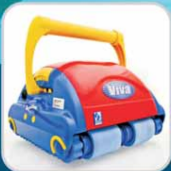
AQUABOT VIVA Residential Pool Cleaner