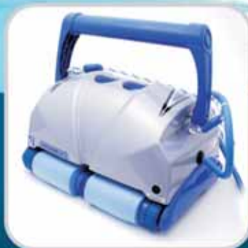
ULTRAMAX JUNIOR Commercial Public Pool Cleaner