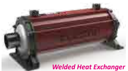
Welded Heat Exchanger