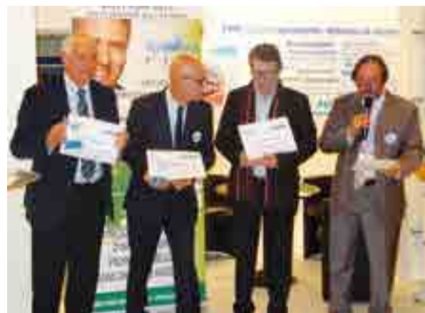
Awards ceremony took place at the show in Lyon in 2014