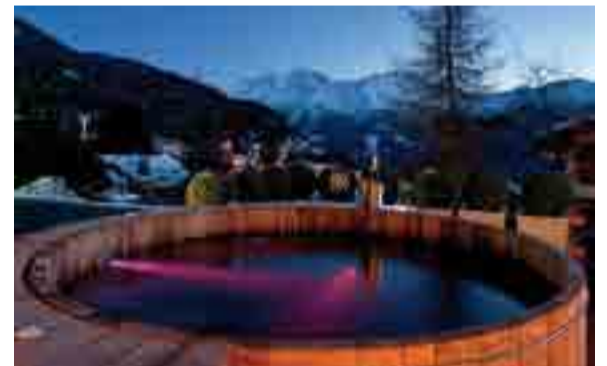
Category D - Domestic Hot tubs - BRONZE: Riviera hot tubs based in England, represented by Robin Cranston