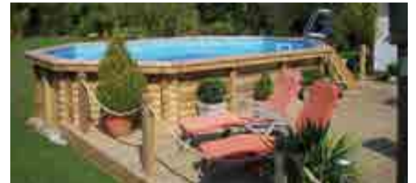
Category E - Above ground swimming pools BRONZE: Home Counties based in England, represented by Mr Trusson.