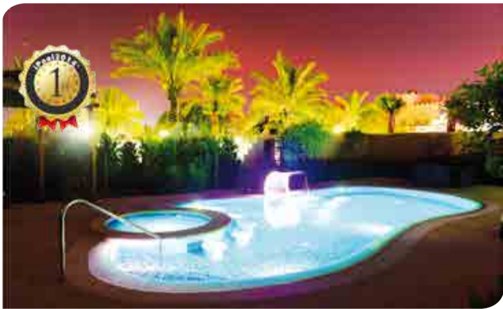
The winning pool by WATERMASTER

iPool2014 thanks you for your many votes and looks forward to your participation in iPool2015 which starts on 31st March 2015.