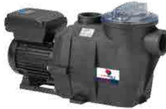
Superpool II VS

Among the new products from pool and spa distributor SCP are a variable-speed pump and an automatic pool cleaner.